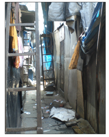
A covered lane.