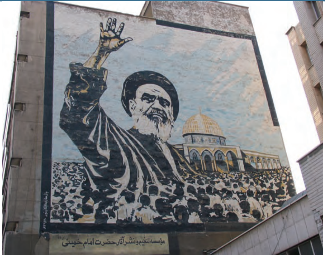
Imam Khomeini towering over the Dome of the Rock.